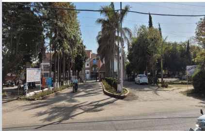
A Multi-Faculty Off Campus of Panjab University, Chandigarh