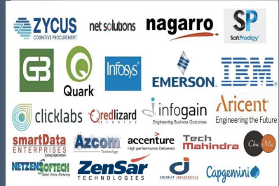
Many More Companies Where Our Alumni Working