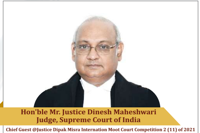
Hon'ble Mr. Justice Dinesh Maheshwari Judge, Supreme Court of India Chief Guest @Justice Dipak Misra International Moot Court Competition 2 (11) of 2021