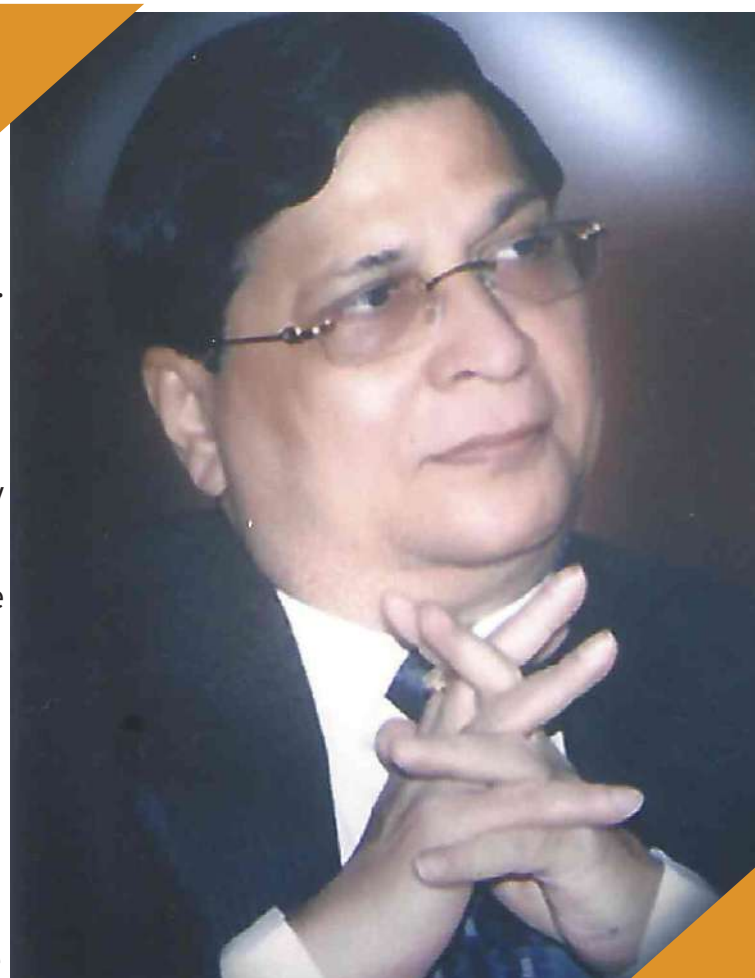
Hon’ble Mr. Justice Dipak Misra Former Chief Justice of India

As a judge of the Supreme Court of India, Justice Misra has delivered several landmark judgments. He has contributed immensely to Indian constitutional jurisprudence and each of