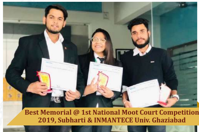
Best Memorial @ 1st National Moot Court Competition 2019, Subharti & INMANTECE Univ. Ghaziabad