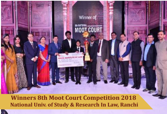
Winners 8th Moot Court Competition 2018 National Univ. of Study & Research In Law, Ranchi