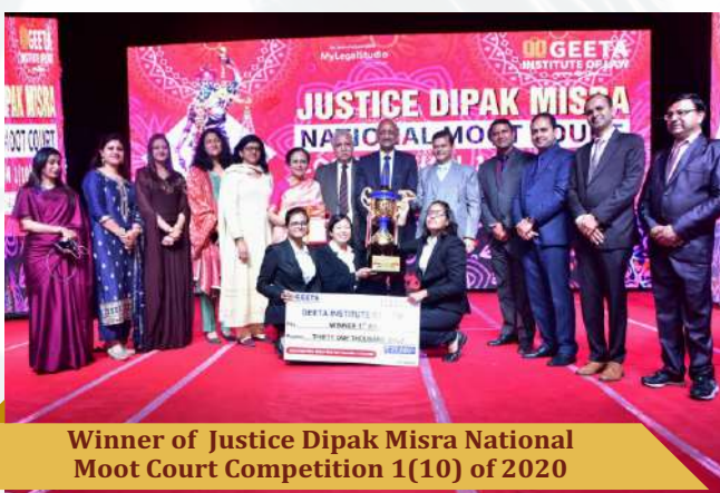
Winner of Justice Dipak Misra National Moot Court Competition 1(10) of 2020