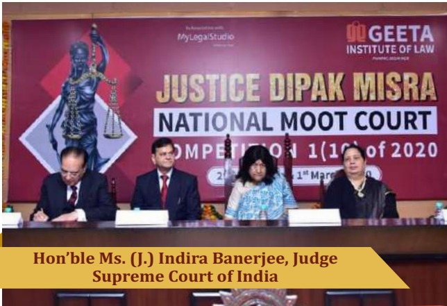
Hon'ble Ms. (J.) Indira Banerjee, Judge Supreme Court of India