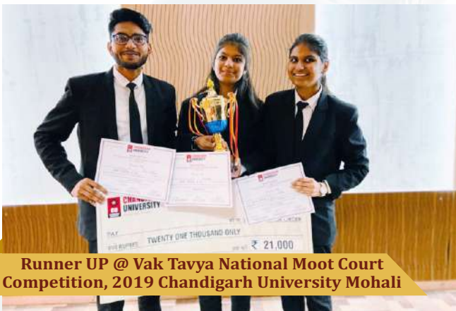
Runner UP @ Vak Tavya National Moot Court Competition, 2019 Chandigarh University Mohali