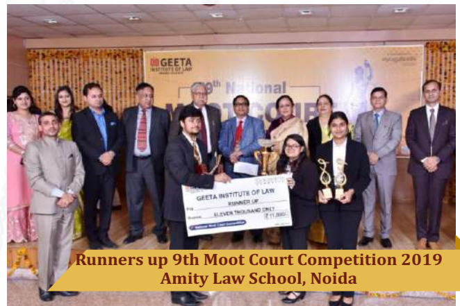
Runners up 9th Moot Court Competition 2019 Amity Law School, Noida