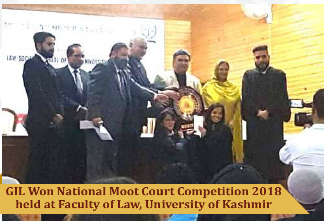
GIL Won National Moot Court Competition 2018 held at Faculty of Law, University of Kashmir