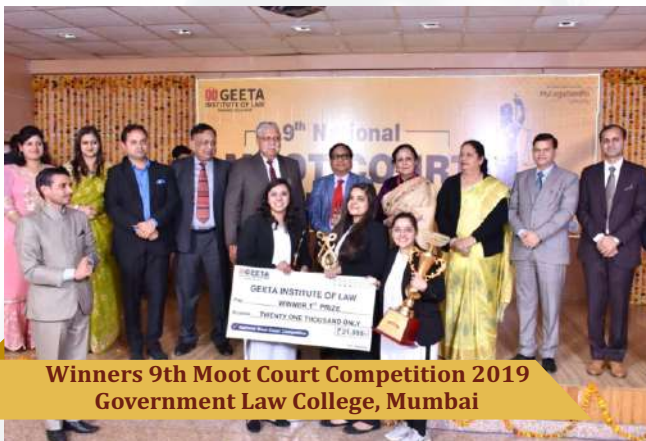
Winners 9th Moot Court Competition 2019 Government Law College, Mumbai