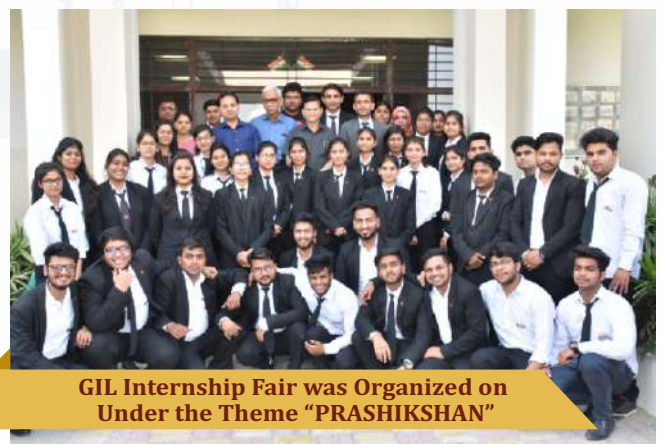
GIL Internship Fair was Organized on Under the Theme "PRASHIKSHAN"