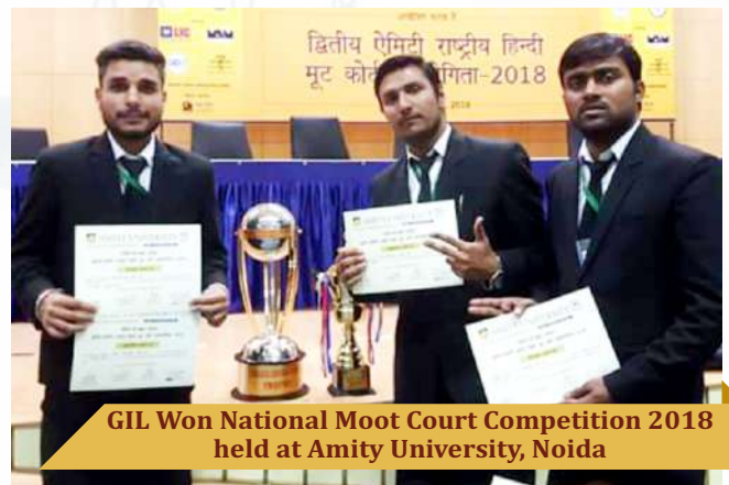
GIL Won National Moot Court Competition 2018 held at Amity University, Noida