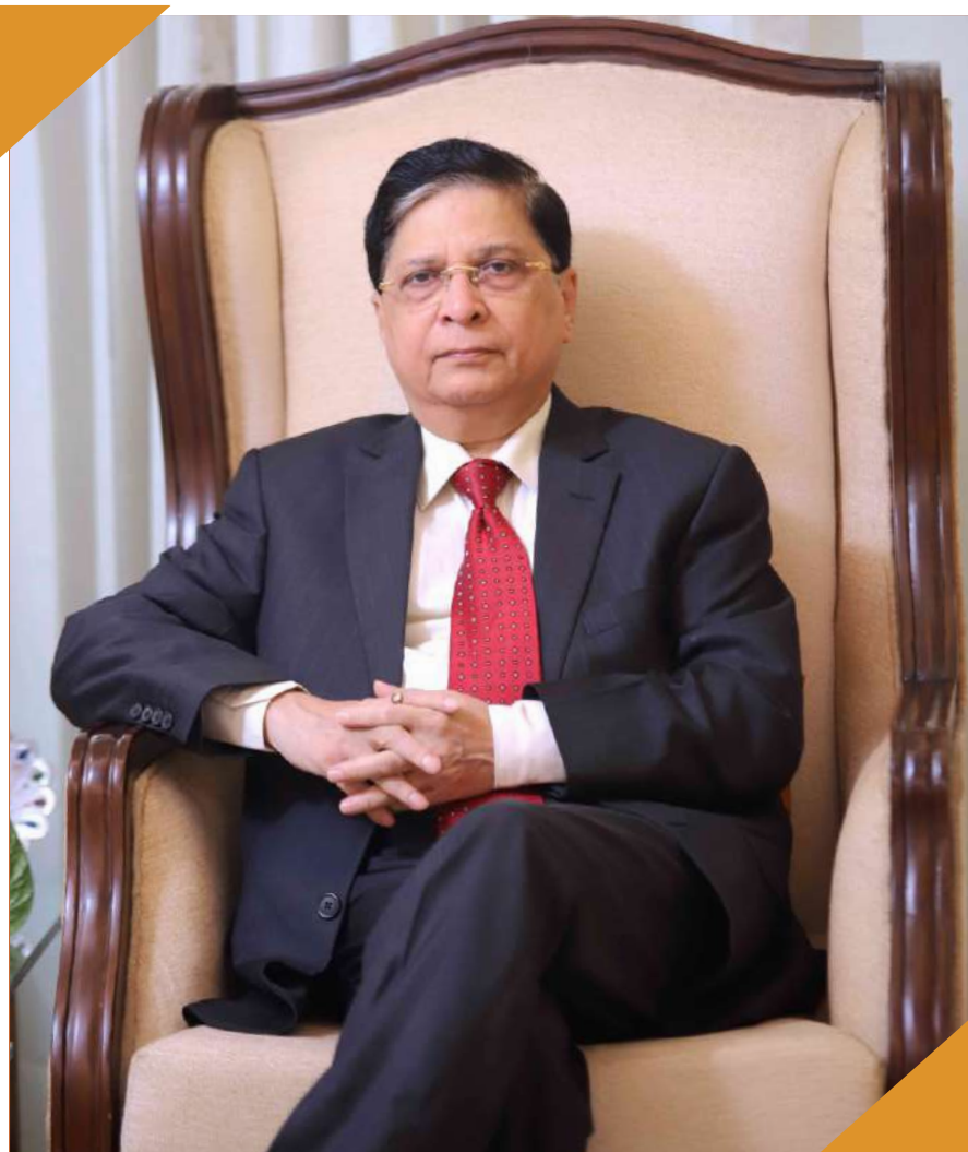
Hon’ble Mr. Justice Dipak Misra Former Chief Justice of India

Hon’ble Mr. Justice Dipak Misra has served as the 45th Chief Justice of India from 28th August, 2017 till 2nd October, 2018. Born on 3rd October, 1953, Justice Misra enrolled at the Bar in 1977 and practised at the Orissa High Court. He was appointed as an Additional Judge of the Orissa High Court in 1996 and was transferred to the Madhya Pradesh High Court where he was made a Permanent Judge in 1997. In December 2009, Justice Misra was appointed Chief Justice of the Patna High Court, serving until May, 2010, where he was appointed Chief Justice of the Delhi High Court. Justice Misra was elevated to the Supreme Court of India on 10th October, 2011 and assumed charge as the Chief Justice of India on 28th August, 2017. A former Judge of Orissa and Madhya Pradesh High Court and a former Chief Justice of Patna and Delhi High Courts, he is a bold and Humane Judge.