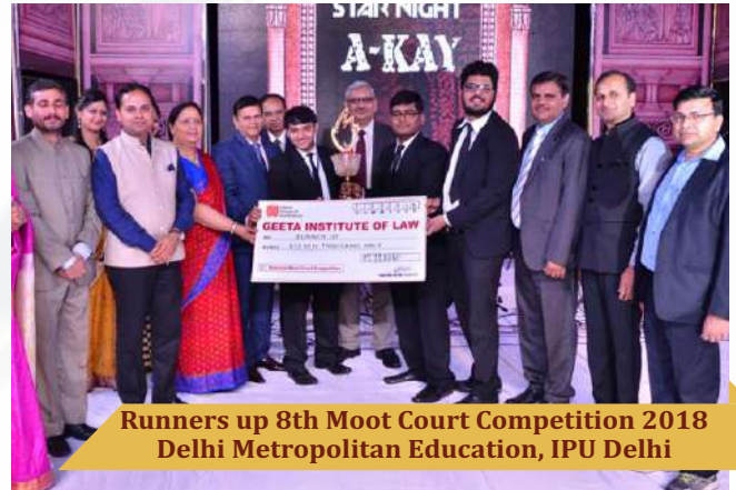
Runners up 8th Moot Court Competition 2018 Delhi Metropolitan Education, IPU Delhi