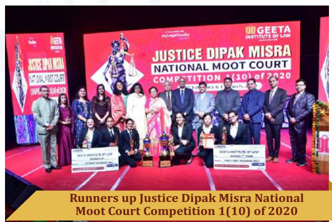
Runners up Justice Dipak Misra National Moot Court Competition 1(10) of 2020