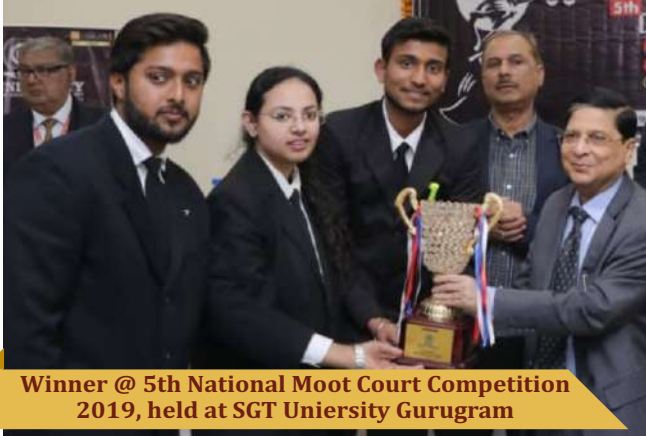
Winner @ 5th National Moot Court Competition 2019, held at SGT University Gurugram