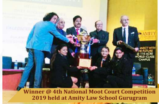
Winner @ 4th National Moot Court Competition 2019 held at Amity Law School Gurugram